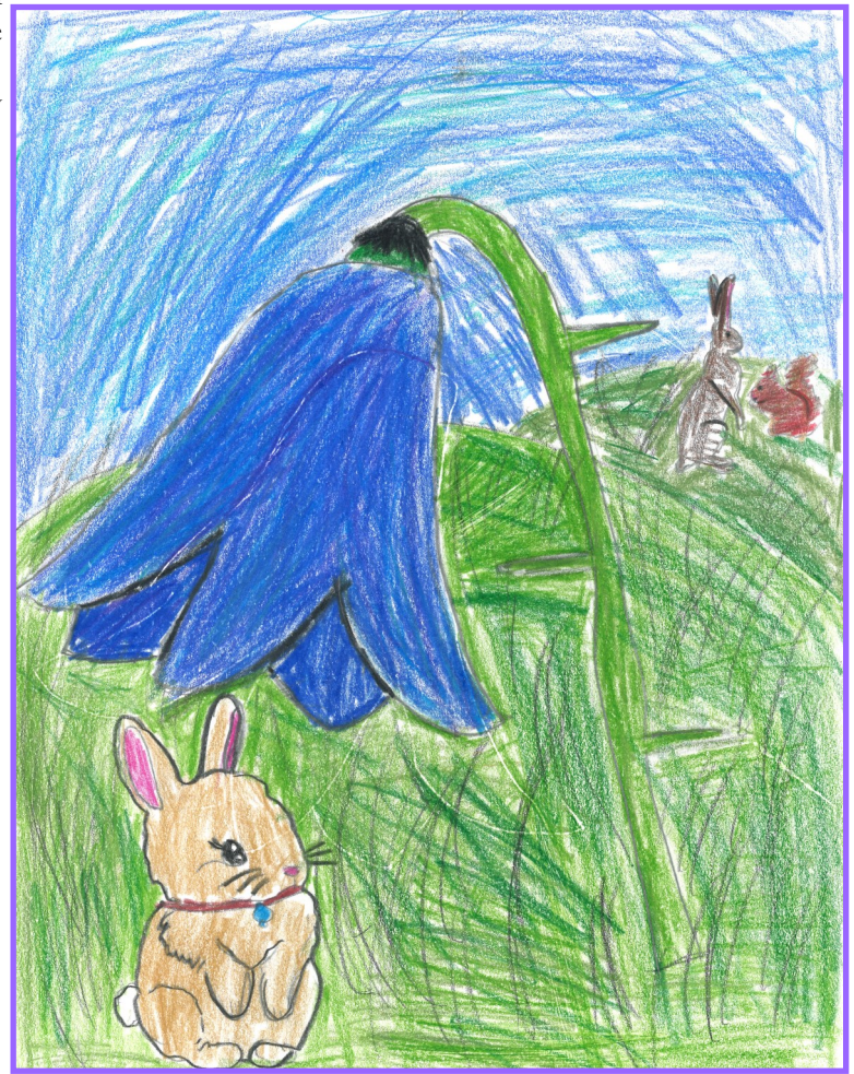
Addie Lute, Radley Elementary