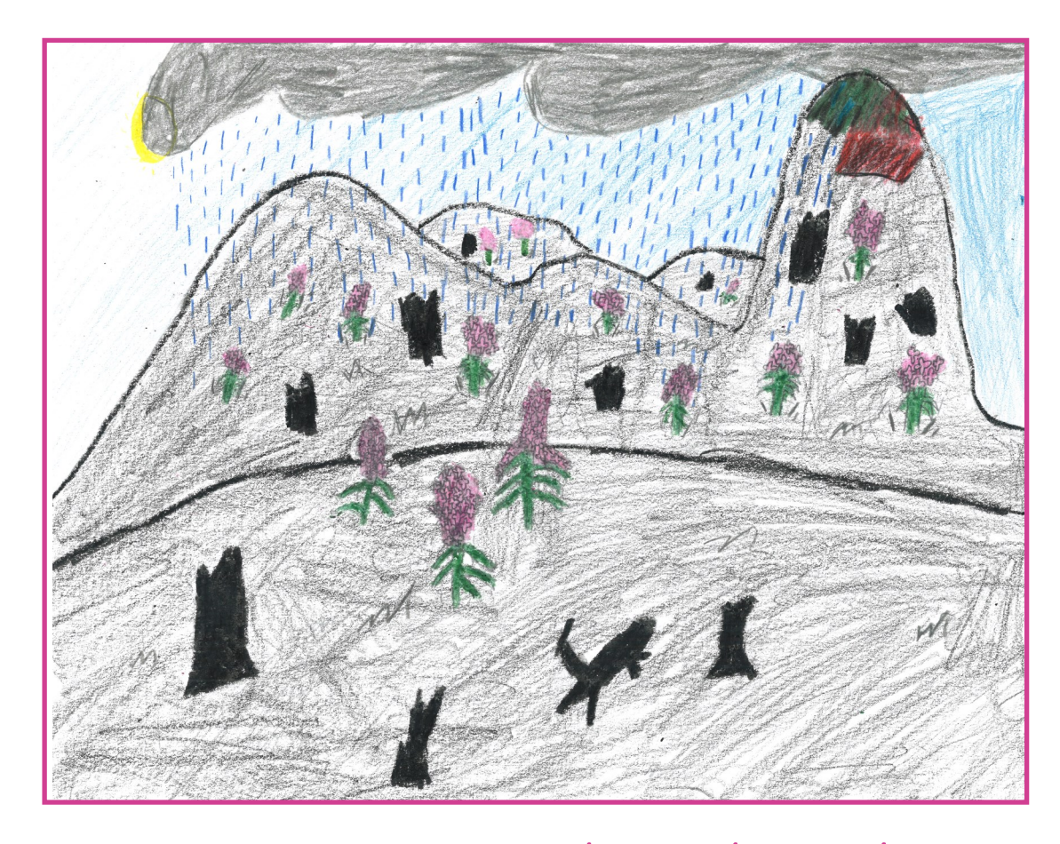
Kaden Krempel, Rossiter Elementary

After the next rain, wherever there had been fire from her footsteps, the beautiful fire-weed grew. It is, to this day, one of the first plants that comes into an area after a fire.