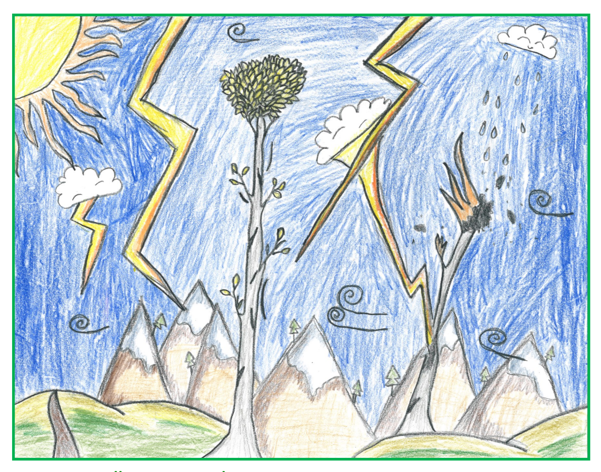
Garrett McLellan, Rossiter Elementary

The next time you are nearing an aspen grove you will see how all of the trees tremble at your approach.