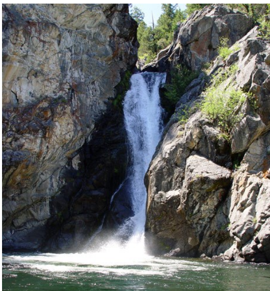
The once-endangered Crow Creek Falls

Crow Creek drains almost half of the Elkhorn Mountains. The creek is formed by the confluence of Little Tizer and Big Tizer creeks, which in turn originate from the glacial cirque basins beneath Crow and Elkhorn Peaks. Crow Creek is, perhaps, most well known for its scenic and once endangered waterfall upstream a few miles from here. Crow Creek is also a popular recreational fishery.