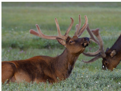
Elk, elk scat and tracks