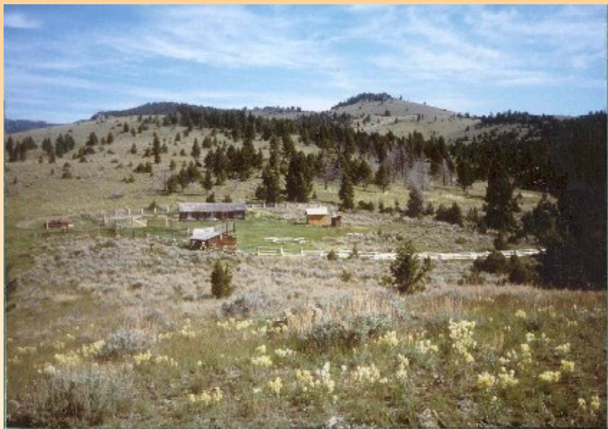
This trail is located in the beautiful Elkhorn Mountains.

From December 2 through May 15th, the last 4 miles are not open to motorized vehicles, access is by foot, ski, or horseback.