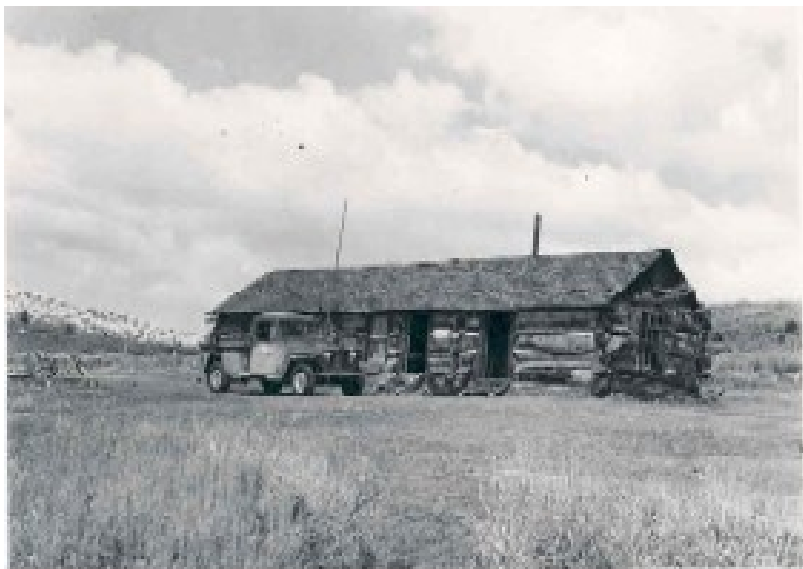
Eagle Guard Station—then and now