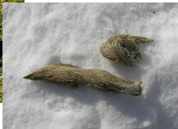
Coyote and scat

The intersection between the short and long loops of the nature trail lies \frac{1}{4} mile