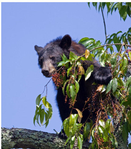
Black bear in chokecherries

Continue on the trail as it follows the course of Eureka Creek toward Crow Creek to find station 6 in about ¼ mile.